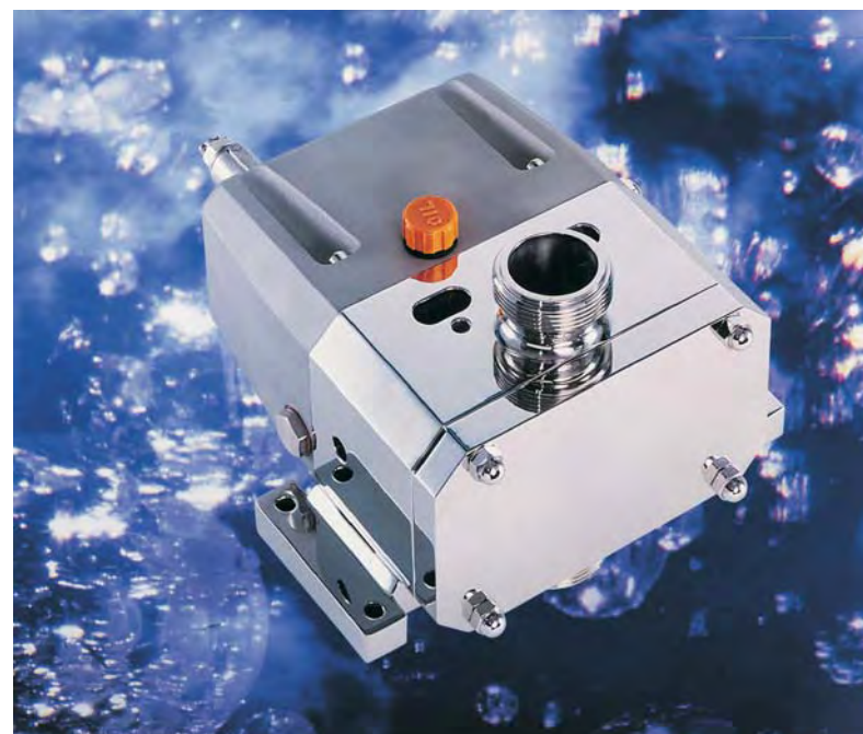
Concept SQ Pump with optional Stainless Steel Gear Cover

Inlet and outlet ports can be finished to a variety of clamp, thread or flange standards, with aseptic fittings available where barrier circulation is required to ensure that the process environment is reliably maintained.