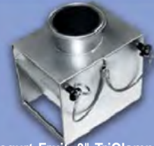
Yogurt Fruit, 3" TriClamp