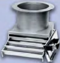
Spice, 11" dia.

Join the Processors Who's Who List... Specify CESCO MagDucts