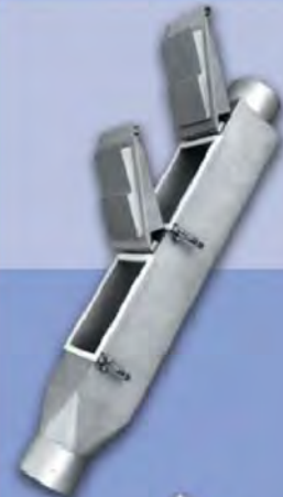
Spice, 6" dia.