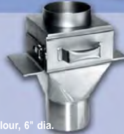
Flour, 6" dia.