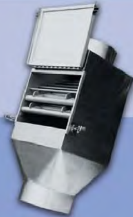
Sugar 60° Line, 6" dia.