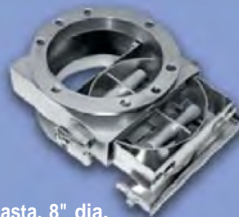
Pasta, 8" dia.