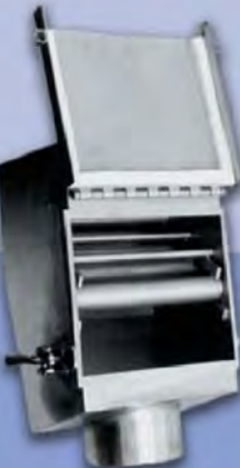
Popcorn, 4" dia.