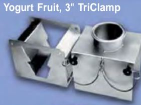
Yogurt Fruit, 3" TriClamp