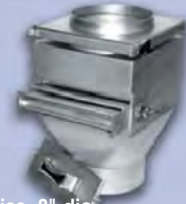
Spice, 8" dia.