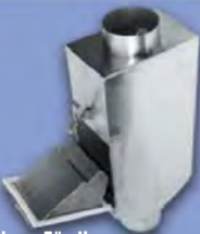
Spice, 5" dia.