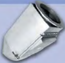
Chocolate, 10" dia.