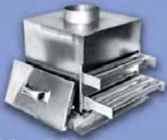
Spice, 6" dia.