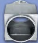
Pasta, 8" dia.